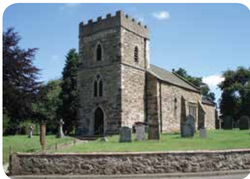
Church at Donington on Bain

G The long route turns left at the farm track, whilst the short route joins the same path from the right. Continue ahead with fine views down to the River Bain valley and beyond. You will also see two masts, one from