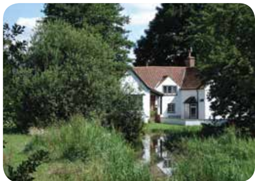
Mill at Donington on Bain

K Pass into the woods and pass over the footbridge and join the lane ahead, turning right at the main road to return to the Black Horse pub.